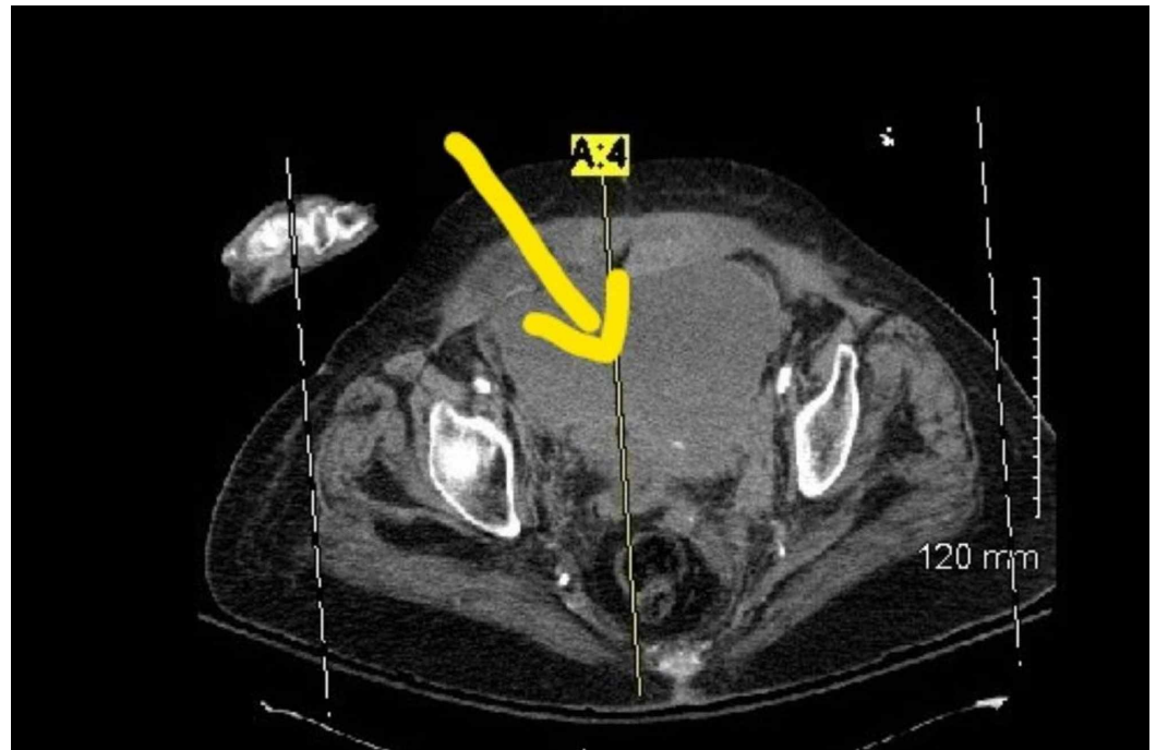
FIGURE 1: Rectus sheath hematoma below the arcuate line in the pelvis compressing the bladder with no blush

Coumadin was held and INR reversed with the help of fresh frozen plasma and vitamin K. The patient had a Foley catheter placed to relieve bladder outlet obstruction. Over the subsequent day, the patient continued to have stable hemoglobin and make urine. In view of the patient's poor performance index and high risk for surgery, a 14 French catheter was placed in the hematoma. Over the subsequent days, clinical examination revealed a reduction in the size of the abdominal hematoma and the Foley catheter was removed on four days post procedure. The patient was able to void independently. The catheter was removed and the woman was discharged from the hospital. At the two-week period, she continued to have a swelling which was smaller in size, however, she remained asymptomatic from it.