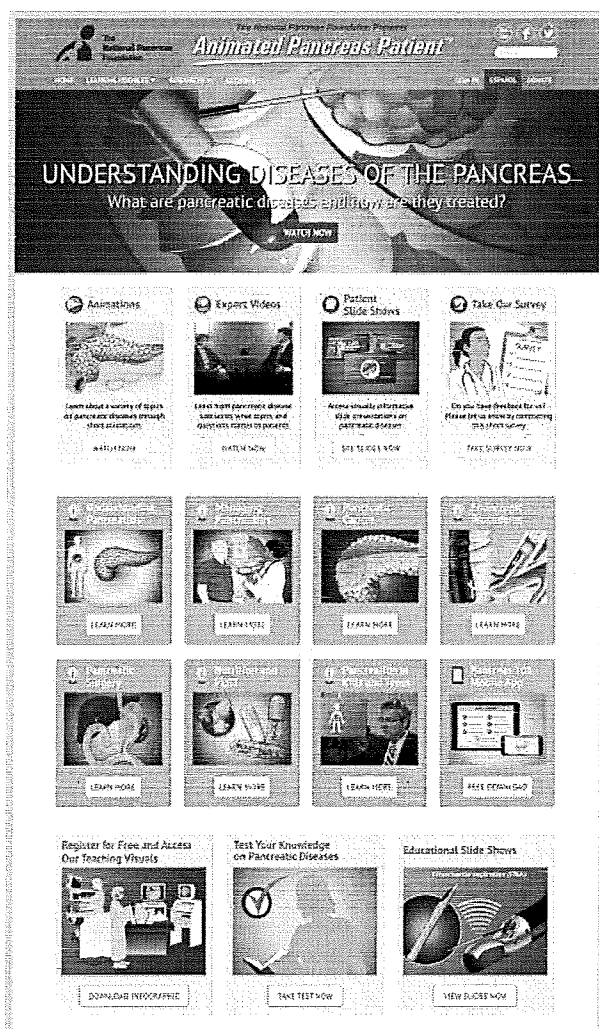
FIGURE 1. Animated Pancreas Patient website.

patients to make informed decisions, improve behaviors, and better partner with their health providers to attain optimal health outcomes, for over a period of 4 years.